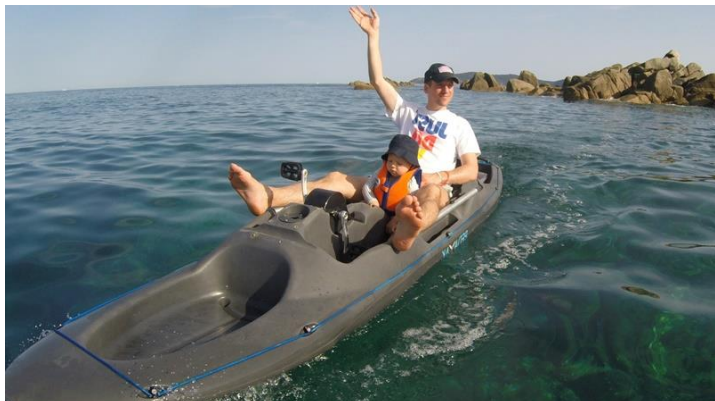
PEDAYAK ELECTRIC « CLASSIC »