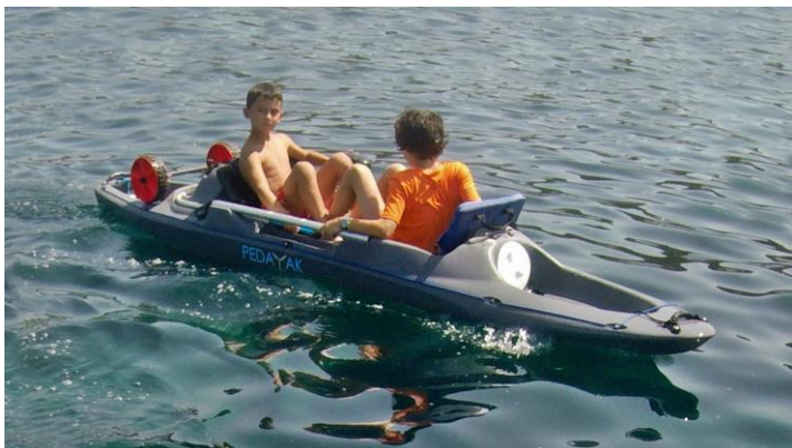
PEDAYAK ELECTRIC « BIPLACE »