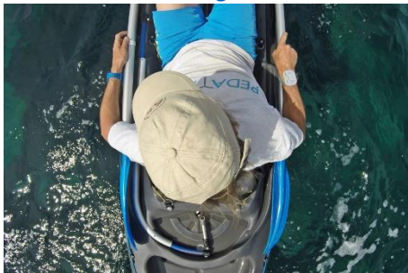
Steering control stick and helm: right or left direction