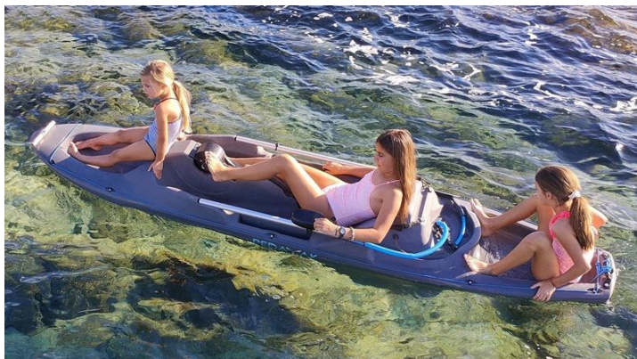
PEDAYAK ELECTRIC « BASIC »